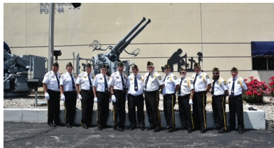
Post 44 Honor Guard

American Legion Post 44 PO Box 194 Newburgh, IN 47629-0194